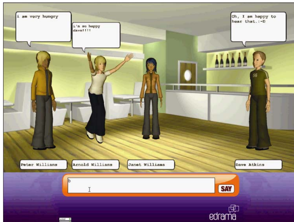
Figure 1 One example of the e-drama virtual stage

In the e-drama system, ‘actors’ (human users) control virtual characters on a virtual stage, with textual ‘speeches’ displayed as text bubbles typed by the actor operating the character. One director and up to five actors are involved in an e-drama session. The actors and director may be located distantly from each other, as all communication is via the internet, through the intermediary of a server operated by Hi8us. A graphical interface shows the characters and virtual stage on each actor’s terminal and the director’s. Actors can choose the clothes and bodily appearance for their own characters. A possible state of the graphical interface is shown in Figure 1. The characters’ visual forms were originally 2D static cartoon figures, with backdrops that could include real-life photographic images. However, we now brought in the option of 3D animated gesturing avatars (though still somewhat cartoon-like) and 3D computer-generated settings using technology from one of our industrial partners, British Telecom (BT). Another useful feature recently introduced is that during an initial phase of an e-drama session, in which the actors familiarise themselves with the background to the scenario, actors can see documentary film material about the background, supplied by our third industrial partner, Maverick TV Ltd.