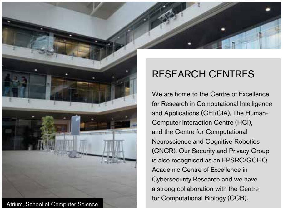
Atrium, School of Computer Science