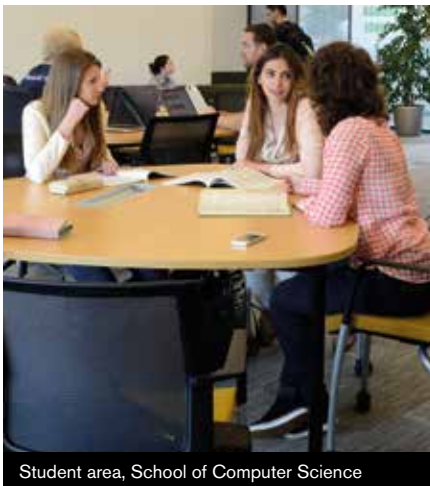
Student area, School of Computer Science