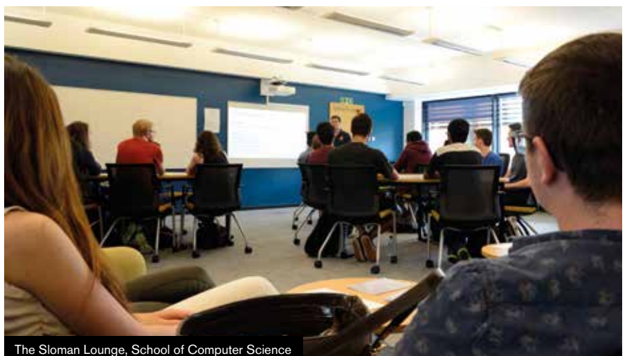
The Sloman Lounge, School of Computer Science