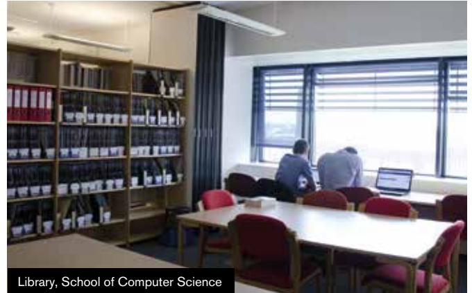
Library, School of Computer Science