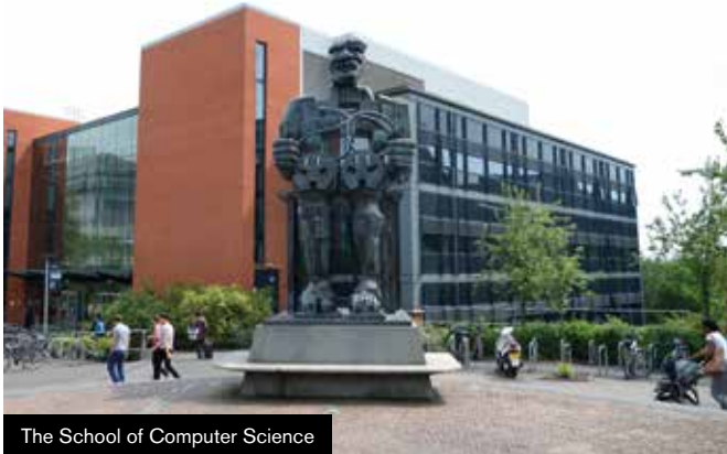
The School of Computer Science